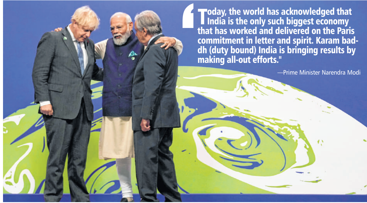
British Prime Minister Boris Johnson (left) and UN Secretary-General Antonio Guterres (right) greet India's Prime Minister Narendra Modi, at the COP26 UN Climate Summit in Glasgow, Scotland, on Monday.

Today, the world has acknowledged that India is the only such biggest economy that has worked and delivered on the Paris commitment in letter and spirit. Karam badh (duty bound) India is bringing results by making all-out efforts.